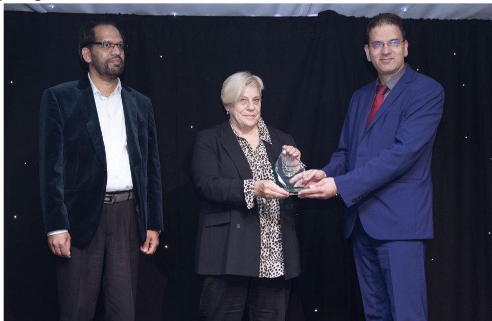
Luton Foodbank recently received an award from Jamia Islamia Ghousia Trust

again, we are nearing the end of what has been another challenging year for all; our staff, volunteers, and the community of Luton. We are indebted to all for their generosity and determination in making sure food comes in and goes out to all those in need. I never fail to be humbled, by donations of food and money both large and small, keeping us going in difficult times.